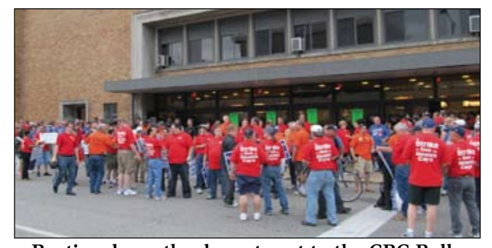
Busting down the doors to get to the CBC Rally